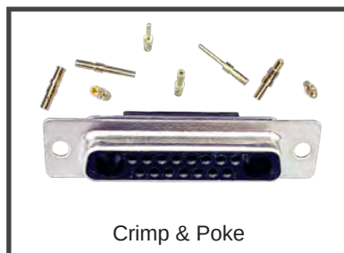
Crimp & Poke