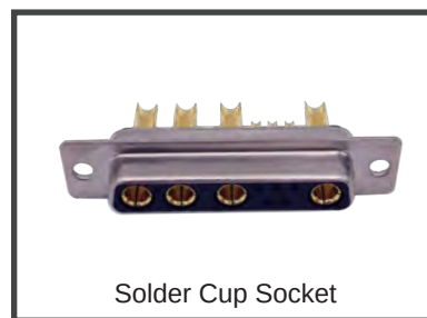
Solder Cup Socket

Screw machined contacts for high mating cycles