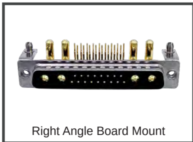
Right Angle Board Mount